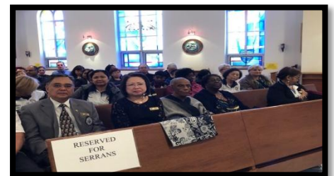
Serra Club of Markham & Scarborough members attending the 2018 Altar Server Award Ceremony at St. Leo The Great parish.