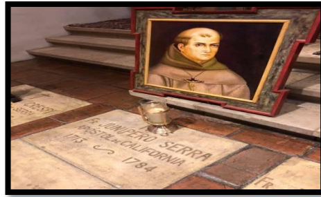
St. Junipero Serra grave at Carmel Mission Basilica