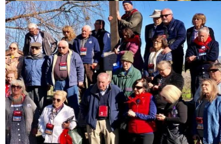
Serra Rally pilgrims in California