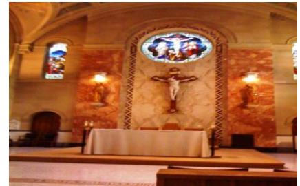
St. Augustine Seminary Chapel