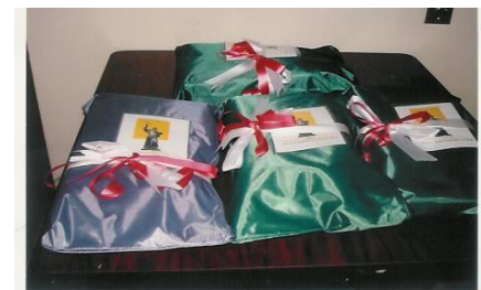
Seminarian's Welcome Kits presented by SCMS members

Through our concerted efforts and a profound desire to accomplish our goals, we put our brains and muscles to work after considering many suggestions on what will comprise a "Welcome Kit ".