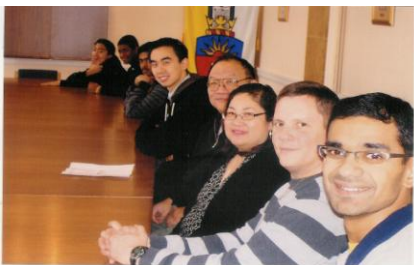
SCMS members with the SAS Seminarists